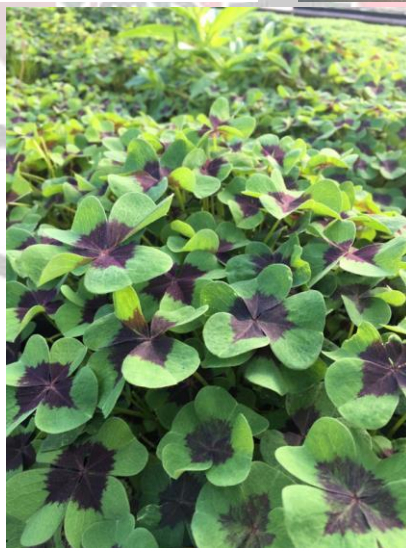
Red and Green Sorrel